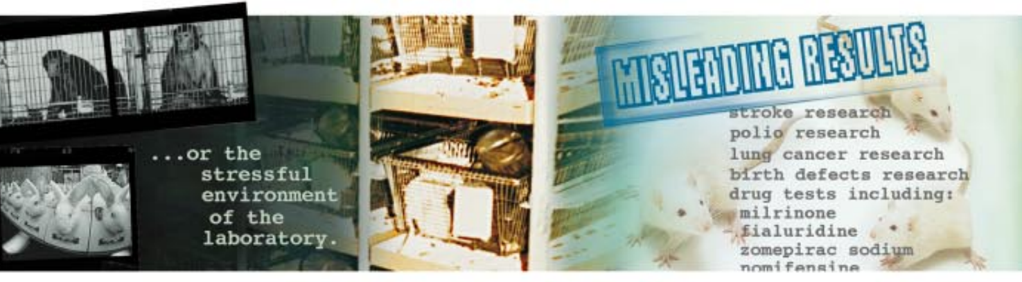
Debate: Animal Research Is Wasteful and Misleading Copyright 1997 Scientific American, Inc. SCIENTIFIC AMERICAN February 1997 81

Many animals have certainly been used in AIDS research, but without much in the way of tangible results. For instance, the widely reported monkey studies using the simian immunodeficiency virus (SIV) under unnatural conditions suggested that oral sex presented a transmission risk. Yet this study