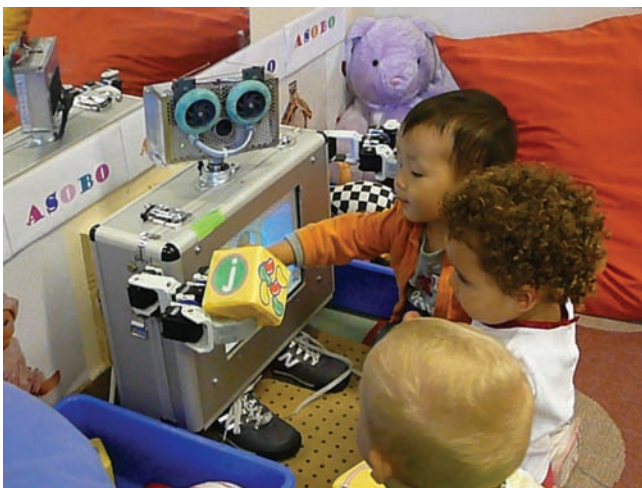
Fig. 4. A social robot can operate autonomously with children in a preschool setting. In this photo, toddlers play a game with the robot. One long-term goal is to engineer systems that test whether young children can learn a foreign language through interactions with a talking robot.

The science of learning has also affected the design of interventions with children with disabilities. Speech perception requires the ability to perceive changes in the speech signal on the time scale of milliseconds, and neural mechanisms for plasticity in the developing brain are tuned to these signals. Behavioral and brain imaging experiments suggest that children with dyslexia have difficulties processing rapid auditory signals; computer programs that train the neural systems responsible for such processing are helping children with dyslexia improve language and literacy (76). The temporal "stretching" of acoustic distinctions that these programs use is reminiscent of infant-directed speech ("motherese") spoken to infants in natural interaction (77). Children with autism spectrum disorders (ASD) have deficits in imitative learning and gaze following (78–80). This cuts them off from the rich socially mediated learning opportunities available to typically developing children, with cascading developmental effects. Young children with ASD prefer an acoustically matched nonspeech signal over motherese, and the degree of preference predicts the degree of severity of their clinical autistic symptoms (81). Children