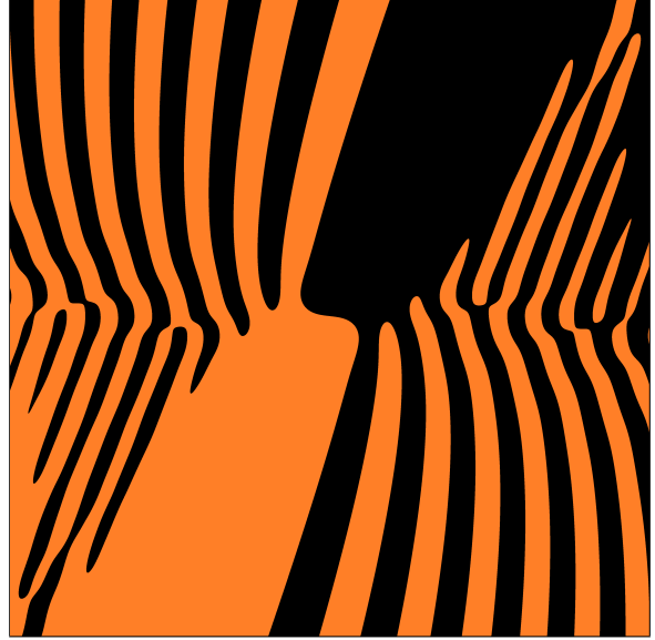
FIGURE 2. The “tiger partition” restricted to the square [-20, 20]^2 . This is the conjectured [21] optimal partition of \mathbb{R}^2 for the purpose of Krivine-type rounding.